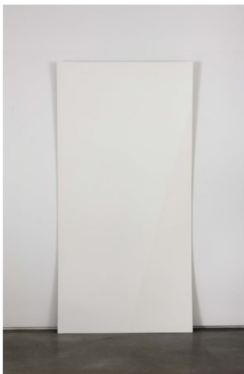
Davis Rhodes, Untitled , 2012 enamel on foamboard 92 x 48 inches; Courtesy of the artist and Team Gallery.

DR: The connection wasn't severed, it was deepened. It's a compression rather than an inflation of different modalities. The "figures" of the work have been collapsed into its materiality, into a state of interiority that is an inscription of its exterior coordinates. A body hyper-sensitive to its outside, resisting representation and moving in different ways. It's an intimate state.