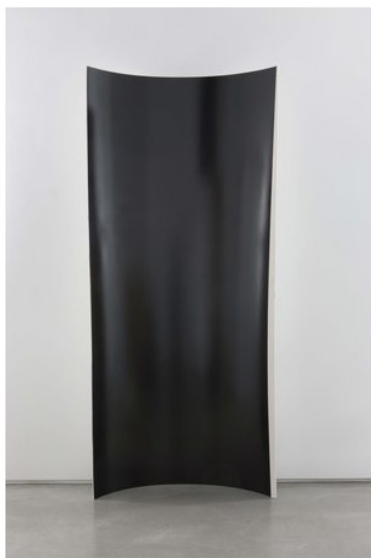
Davis Rhodes, Untitled , 2011, latex and enamel on foamboard, 96 x 48 x 10.5 inches.

Silence is most attractive to me now, in a culture that is hysterical for transparency, for the consummation of identity. I'm interested in opacity, alterity, intimacy, a kind of perceptual zero point – to allow what cannot be painted to be present and threaten what is visible.